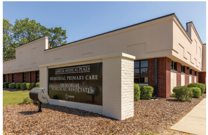
Amelia Medical Plaza 505 Amelia St. Bainbridge, Georgia (229) 243-6900

Patients are encouraged to speak with their provider or contact the office to learn more about establishing care or enrolling in Chronic Care Management and Remote Patient Monitoring services.