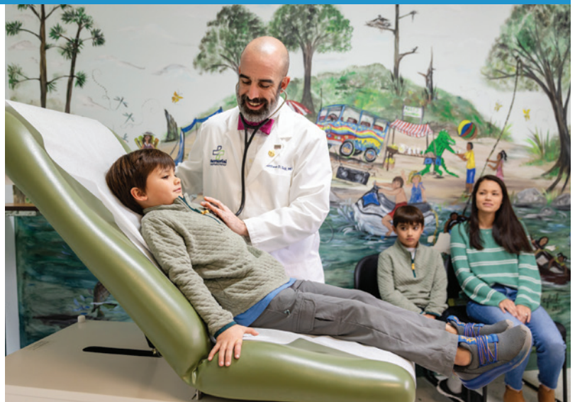
Memorial Pediatrics 603 S. Wheat Avenue Bainbridge, Georgia (229) 246-1209