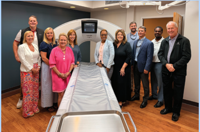
Thanks to the support of the Memorial Hospital Foundation, a new CT machine was purchased, as well as new furniture for the ER waiting room. The front hospital parking lot was also resurfaced.

Over the past two years, the impact of community support has been clearly visible. Through the generosity of donors, the Foundation has made possible the purchase of new Emergency Department furniture, the paving of the hospital parking lot, and